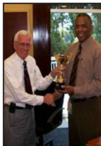
Contracts earns the coveted safety cup!

Employee and family wellness benefits our mission, in response the Wellness survey, we are offering fitness center memberships at reduced costs! See your supervisor for details. Look for more Wellness initiatives to follow.